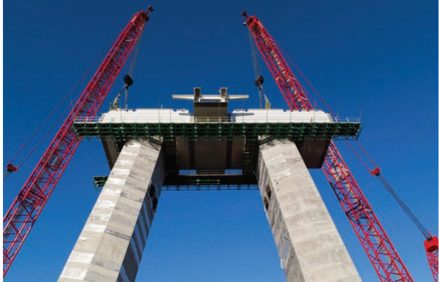
The New Champlain Bridge corridor, one of the largest infrastructure projects in North America, is moving along well, according to industry experts.