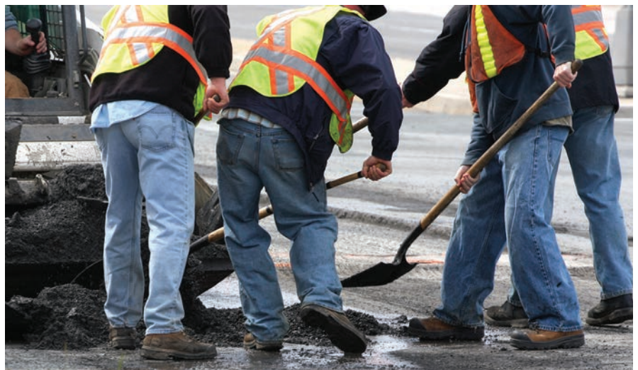
Top: Montreal’s Turcot Interchange Project. Bottom: Toronto road construction.

Atkinson is sympathetic, quick to acknowledge the complexity of what’s